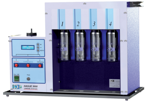
HAGUE 3000 - carbon 14 sampler

The HAGUE 3000 14C sampler is the perfect instrument for measuring low levels of Carbon 14 in air in its gas and organic forms. Particular applications include sampling of air from stacks, hoods, rooms and the environment.