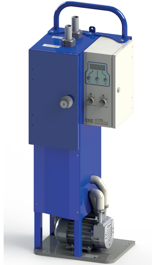
AS 5000 in stationary configuration