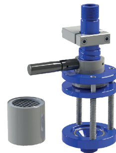
Filter holder TPHP (quick replacement of filters)

A simple rotational movement of the handle releases the cartridge holder of filter paper holder without need of disconnecting it from air sampling circuit.