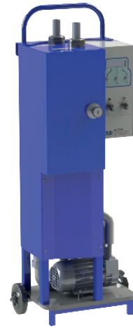
AS 5000 in mobile configuration