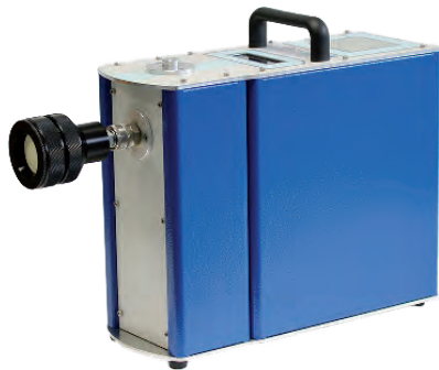
AREA AIR SAMPLING