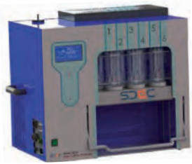
SAMPLING ON AIRBORNE EMISSIONS