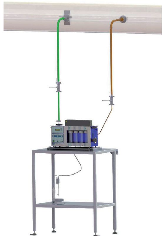
HAGUE 7000 installed in emission monitoring