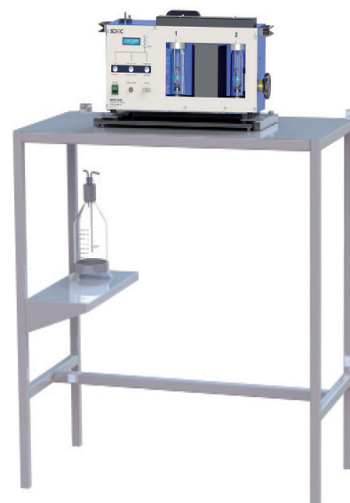
MARC 5000 on frame