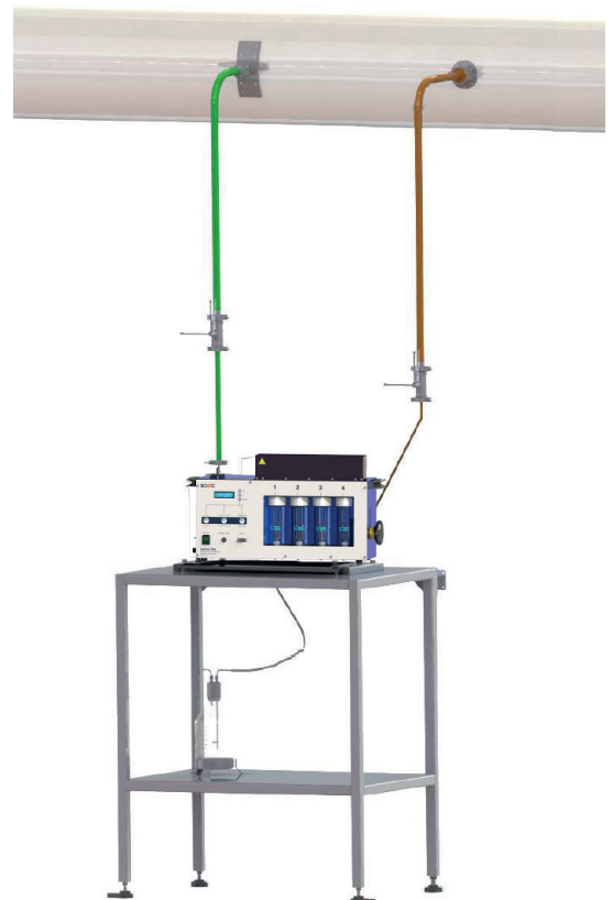
MARC 7000 installed in emission monitoring